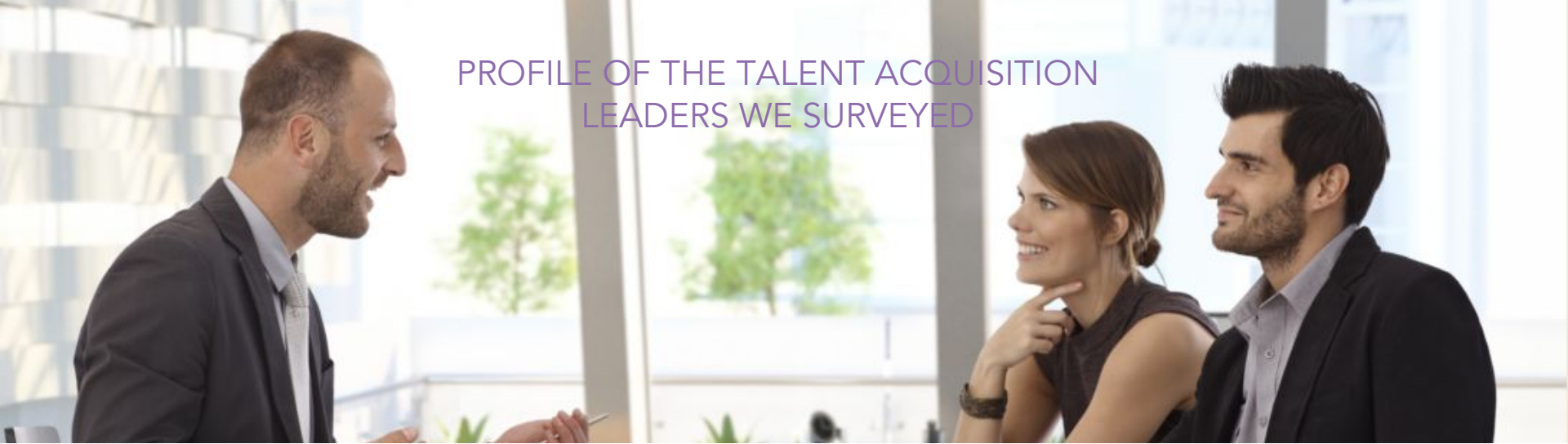
INDUSTRY REPRESENTATION (%)