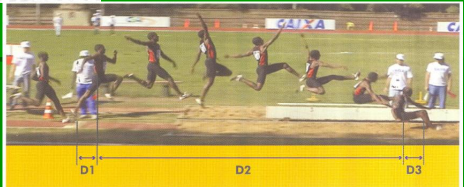
Figure 1: Partial distances in the long jump