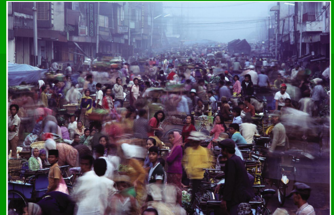
(b) Urban society