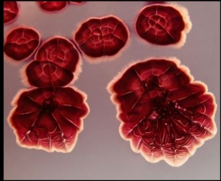
Streptomyces sp. red rubromycin