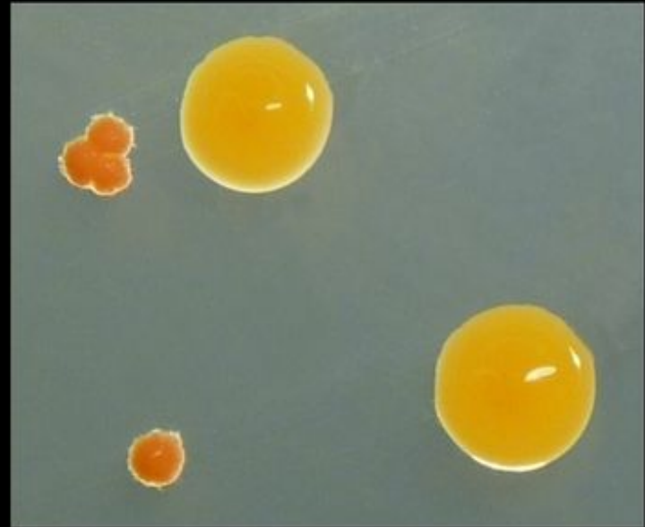
Chryseobacterium indologenes yellow flexirubin